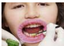
Professional care in children