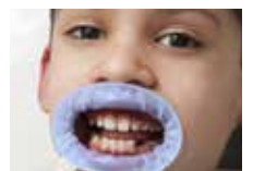
Optimally placed OptraGate