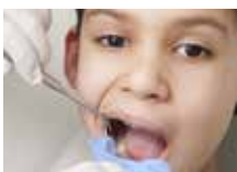
A relaxed mouth makes placement easier