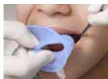
Insertion in the left corner of the mouth