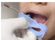
Insertion in the right corner of the mouth