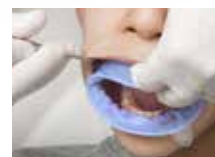
Placement behind the upper lip