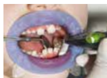
Restorative treatment in children