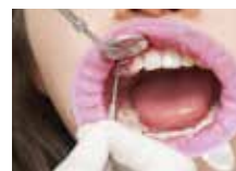
Diagnostics in children