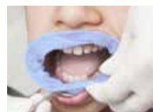
Placement behind the lower lip