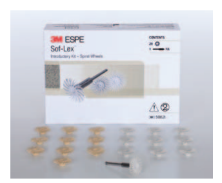
Sof-Lex™ Spiral Wheels—Introductory Kit 5082I